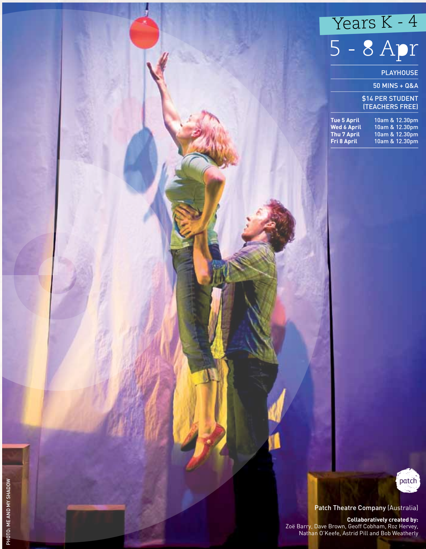
PHOTO: ME AND MY SHADOW